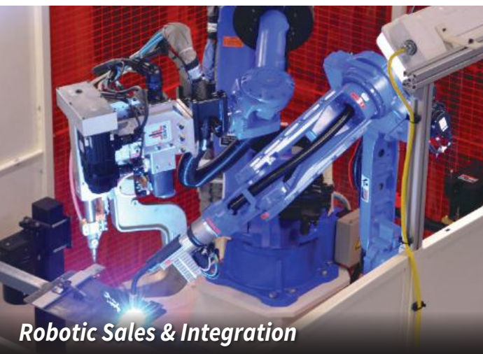
Robotic Sales & Integration