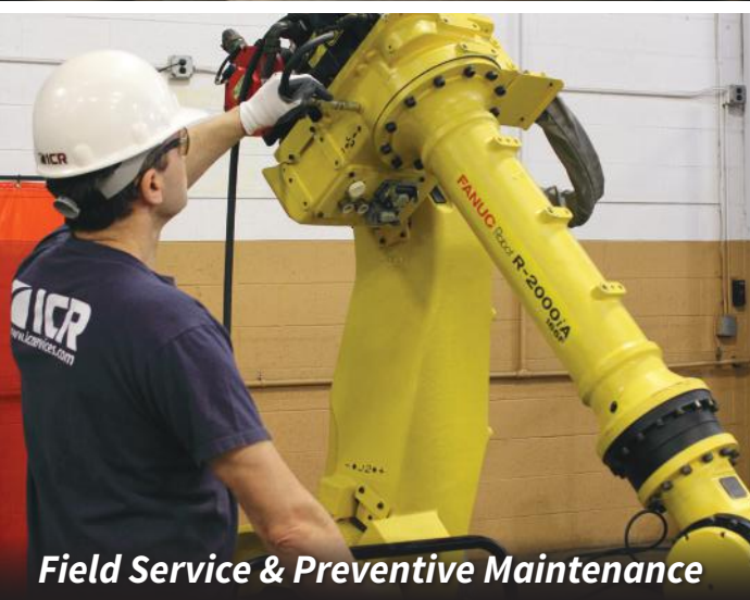
Field Service & Preventive Maintenance

ICR is committed to bringing excellence to your automation, and maximize your production uptime!