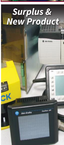
Surplus & New Product